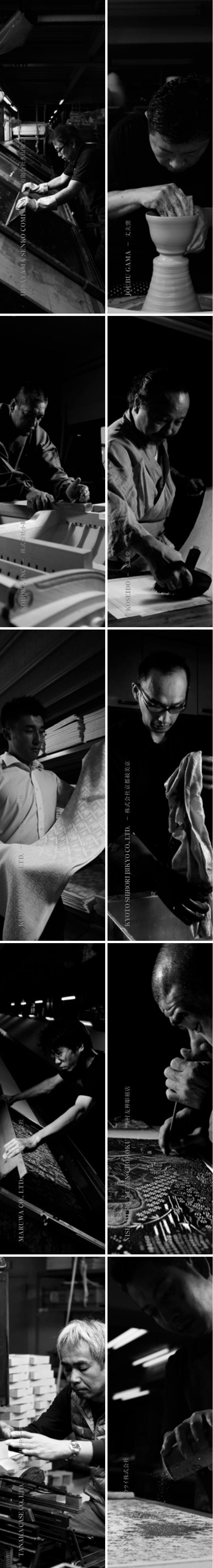
HISAYAMA SENOJO COMPLEX - 伊勢神宮