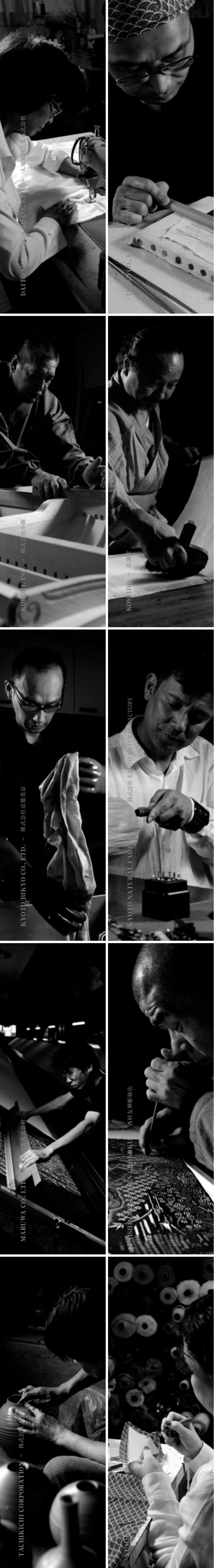
DATTO-STUDIO CO., LTD. - 大田の道具工芸株式会社